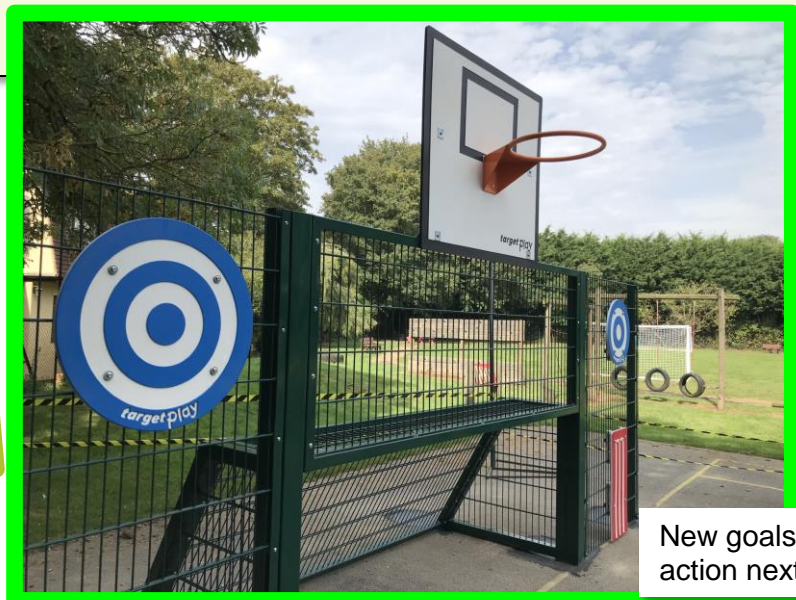
New goals ready for action next week.